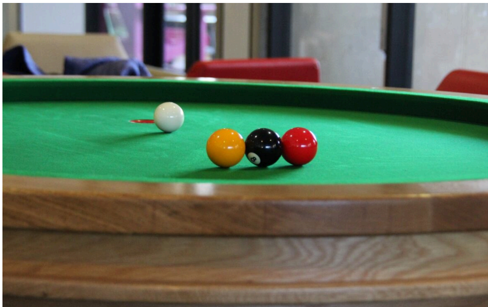
The starting setup for the game Loop.

The game Loop has only two coloured balls, along with the black 8-ball and white cue ball. The remaining rules of the game run like pool, with each player taking turns until one person sinks their coloured ball into the single hole located in the middle of the table at "one of the centres of the ellipse," said Watt.